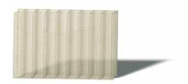
Sample 2: \Delta Yi = 2 : LEXAN THERMOCLEAR sheet warranty