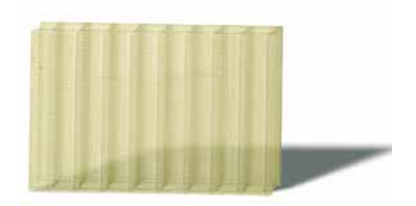
Sample 3: \Delta Yi = 10 : Typical polycarbonate multiwall sheet warranty