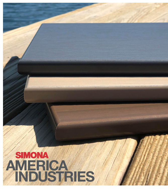
Olyphant Oak Northeastern Walnut